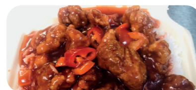
Crispy Pork In Sweet Chilli Sauce £7.50 add £1.50 extra for 1/2 rice 1/2 chip

The management and all the staff at Bobo Goa sincerely hope you enjoy your meal. Your satisfaction is our aim. "Bobo Goa" is a Chinese phrase which translates into "To continuously improve". This phrase is our philosophy in which we aim to transcendent into all our practices from Preparation to Hygiene, and from Customer Service to Food Excellence. Thank you for your custom and we look forward to seeing you again.