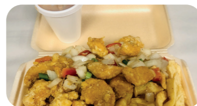
Value Box for 1 £10.50