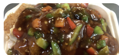
Chicken Fillet In Black Pepper Sauce £7.50 add £1.50 extra for 1/2 rice 1/2 chip